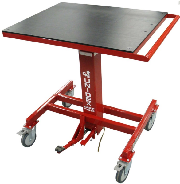
ESD liner and grounded