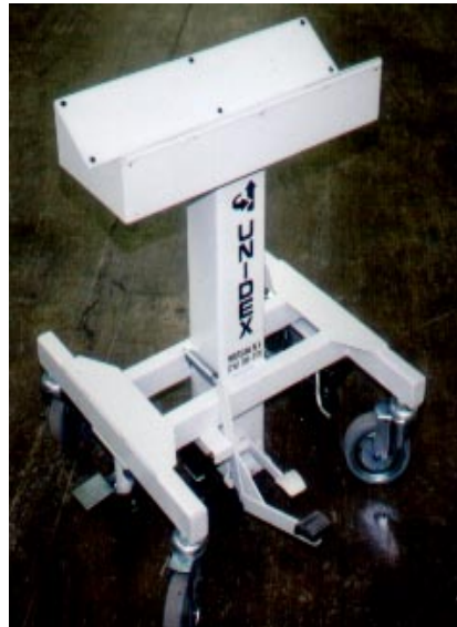
V-Cradle to hold tubes