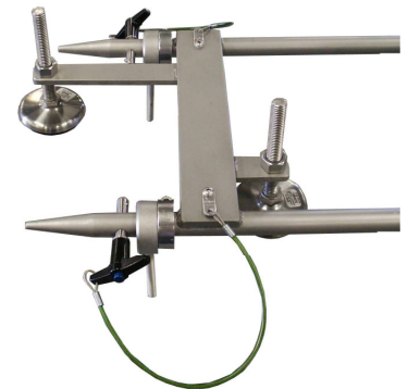
Manipulators & End Effectors