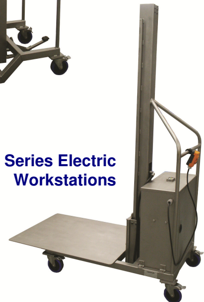
PE Series Electric Workstations