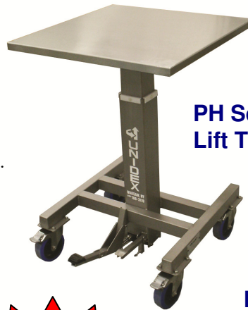
PH Series Mobile Lift Tables